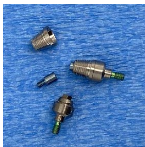
Figure 7: (Left side top to bottom) Prosthetic connector, connector retaining screw & non-engaging multi-unit abutment that screws directly into the implant. (Right side) Assembled parts.