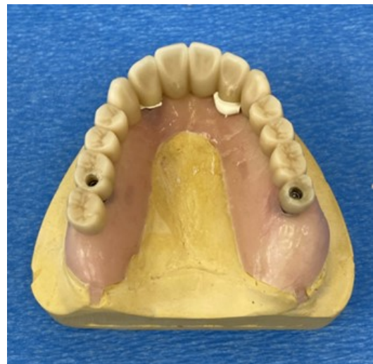
Figure 14: The dentist cleans away the supragingival excess cement and then fills the posterior screw-access holes with Teflon tape and a resin material.