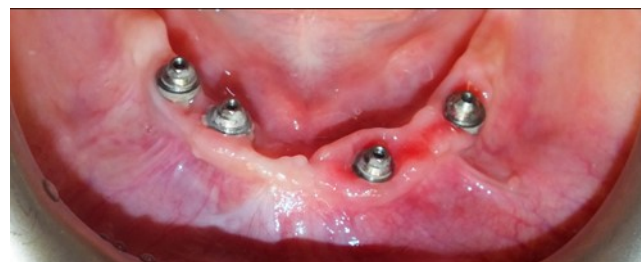
Figure 3: Shows abutments with plaque positioned in difficult to clean positions where misfit prosthetic connectors were attached.