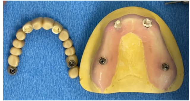
Figure 15: The dentist removes the posterior retaining screws, easily overcomes the temporary cement bond in the anterior and lifts the prosthesis out of the mouth. It is easily retrievable.

In any case, we now have a proof of concept, whereby the dentist can optimize the fit of implant parts and prosthesis, render the prosthesis maintainable by the patient and removable by the dentist. This is better! This is a New Standard of Care.