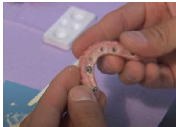
Figure 4: The laboratory technician is cementing the prosthetic-attachment parts into the prosthesis that is made to fit a dental model.

In the Lab: For an all-on-x case, the lab technician has affixed multiple prosthetic-attachment parts to a large prosthesis to fit the position of multi-unit abutment analogues on a dental model. (Figure 4) To reiterate, the lab has connected high precision parts that have low tolerance for error into a prosthesis that is way less accurate than those parts can tolerate. In so doing, the first root cause of misfits, called PDE, has become part of the current installation system.