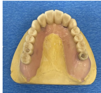
Figure 16: The dentist can easily reinstall the prosthesis. It is maintainable by the patient and the dentist. This is important.

In Conclusion: It is possible to install an All-On-X prosthesis without exposing patients unnecessarily to complications resulting from misfit implant parts and poor access to maintenance. These are common consequences of the current installation systems. The Svoboda Way of installation enables the dentist to optimize the fit of implant parts, optimize the passivity of the prosthesis, provide the patient and dentist access for maintenance and retains easy prosthesis retrievability. The Svoboda Way establishes a “ New Standard of Care ” for All-on-X prosthesis installation. It should be implemented into practice today.