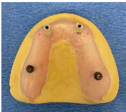
Figure 5: The laboratory technician assembles custom made hybrid zirconia abutments in the anterior and stock prosthetic connectors onto multi-unit abutments in the posterior.

In the Lab: This time the laboratory technician makes the prosthesis as usual, but instead of joining the prosthetic connector to the prosthesis, the technician leaves adequate space between the prosthetic connector and its intended housing to compensate for PDE. That space could vary depending on the technology used to create the prosthesis. A good starting point for a milled prosthesis could be 120 microns. This is about the thickness of a coarse human hair. The lab technician also seals the screw access hole opening in the prosthesis with acrylic and delivers the prosthesis and the prosthetic connector to the dentist, separately. (Figures 5-9)