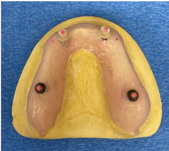
Figure 11: The dentist places Teflon into the screw access channels to create easy access to screws for prosthesis removal.

In the cases where the prosthesis margins are expected to interact with the adjacent tissues, it would be advisable to use a margin specifically designed to prevent subgingival cement,