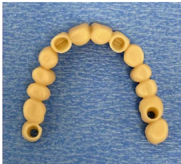
Figure 8: The laboratory technician creates the prosthesis to fit onto the retaining parts including the prosthetic connector. 120 microns cement space is used to compensate for PDE.