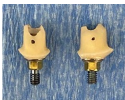
Figure 6: Hybrid zirconia abutments cemented to Titanium bases