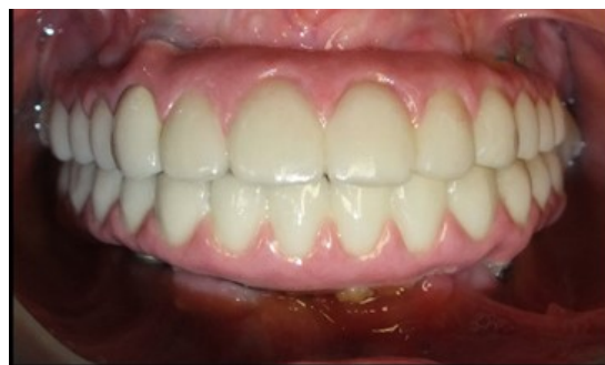
Figure 1: Upper and lower all-on-x prostheses in place. Note plaque on facial aspects of mandibular implants.

Figure 1 shows all-on-x in the mouth of a patient. Note the plaque accumulation on the facial of the implants in the mandible. Figure 2 shows the undersurface of the mandibular prosthesis. Note the abundant plaque accumulation and the facial-lingual dimension of the prosthesis profile in the anterior region. It would be difficult to access the peri-implant tissues to assess the tissues or remove plaque or calculus from this region. Figure 3 shows the plaque and inflammation in the peri-implant environment. Note the position of the multi-unit abutments in relation to the gingiva. Their position varies from slightly supragingival on the patient’s right side to equigingival and subgingival on the left side. As well the left side abutments appear to be shiny due to the movement of the prosthesis on that side. I would like to suggest that the conditions of the peri-implant environments far from ideal, as there are signs of peri-implant disease that may also be exacerbated by the unstable fit of the abutment-prosthesis connectors and the inability of the patient to practice effective oral hygiene.