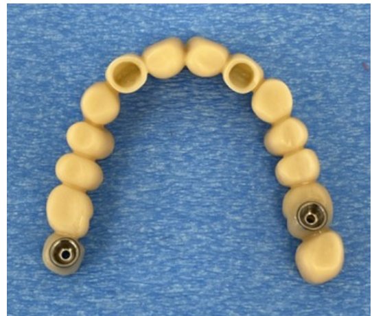
Figure 13: The tissue facing surface of the prosthesis is exposed and the polymerized excess cement around the prosthetic connectors has been removed. The cement line was polished.