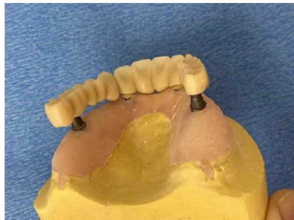
Figure 10: The dentist is able to place and remove the prosthesis from the mouth to ensure that fit and occlusion is idealized. There is sufficient cement space to facilitate this process.