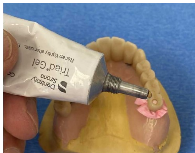
Figure 9: The laboratory technician seals the screw access holes in the posterior to help the dentist to control cement volume and extrude excess cement from the margins of the prosthesis.