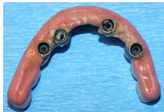
Figure 2: Underside of mandibular prosthesis. Note plaque adjacent to implants and wide profile that blocks access to care.